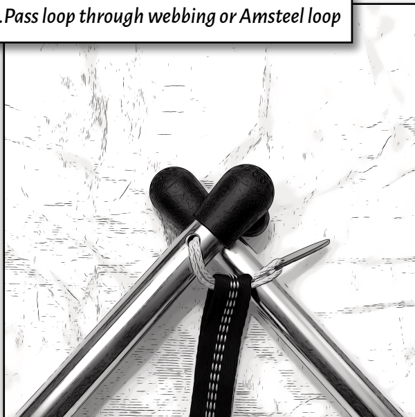
3. Pass loop through webbing or Amsteel loop